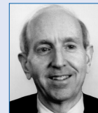
Judge Richard A. Posner , Judge, United States 7th Circuit Court of Appeals, Senior Lecturer in Law, University of Chicago Law School, USA